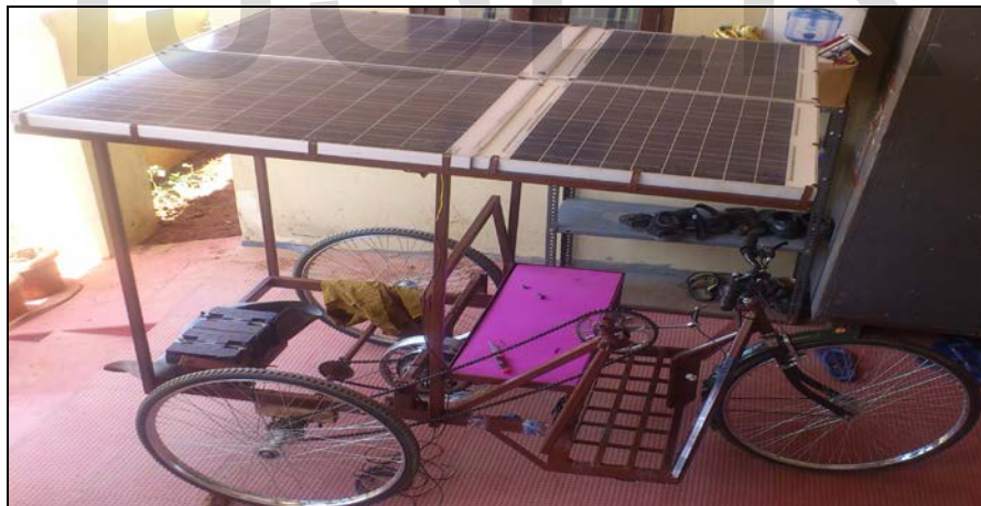
Fig:8. Final vehicle