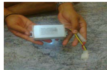
Fig: 7.DC-DC converter