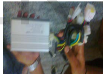
Fig: 6. power controller

lap is made. The maximum solar radiations are obtained between morning 10am to evening 3:30pm. Hence the panel is so mounted that maximum output may be obtained. As the supply is given through dc-dc switch the motor takes a high starting current to propel the wheel to move in forward direction. On start the load on motor is nearly 250kg including the weight of person driving it. The motor after start acquires the maximum speed of 10kmph to 20kmph. The batteries get charged always from the solar panel and so it provides the continuous run for the vehicle. The speed may be varied later according to the driver's requirements. As the speed varies the load current also varies. So the speed variation must be low to keep battery alive for maximum duration of time. For stopping the motor, the speed control switch should be brought to minimum speed and then switch should be open; thereafter the mechanical brakes should be applied. The mechanical brakes can be applied instantly during emergency but this should be avoided as this could damage the motor and also produce unnecessary back emf. The average battery back-up is around four hours. The batteries are continuously charged by the solar panel.